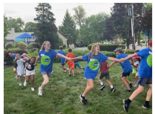
Summit commUNITY Camp VBS