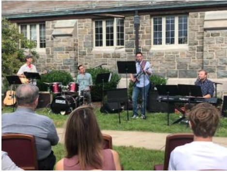
WAVE on June 12