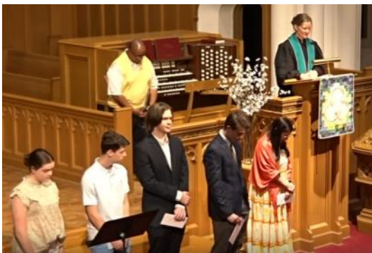
Graduate Recognition Sunday (June 12)