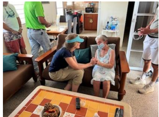
Youth Mission Trip to Puerto Rico