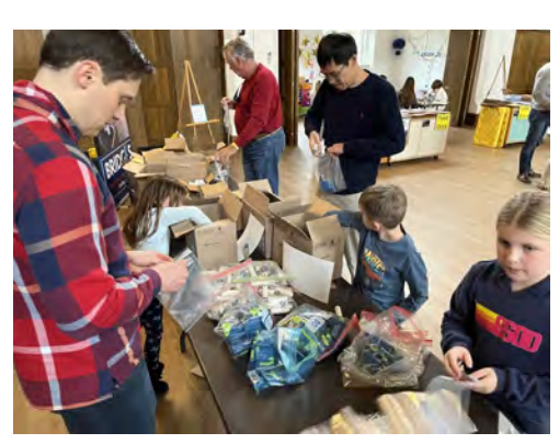
MLK Day of Service