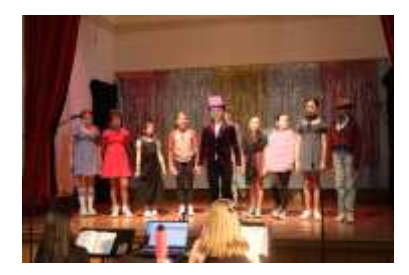
Theater Camp, an after-camp of VBS, performed Willie Wonka