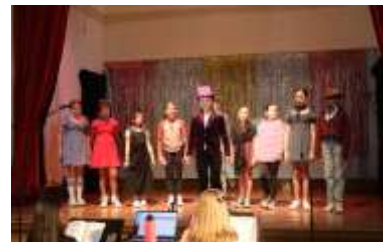
Theater Camp, an after-camp of VBS, performed Willie Wonka