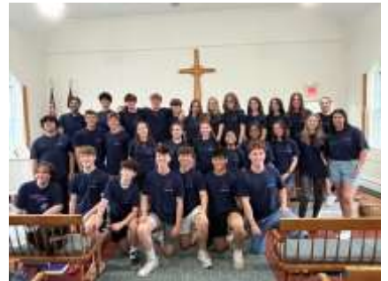
Youth Mission Trip to Maine