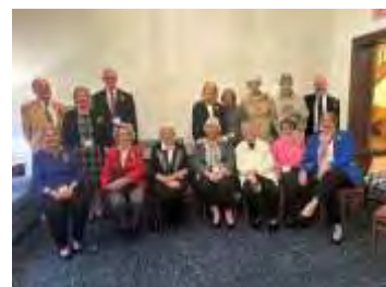
50+ Year Members