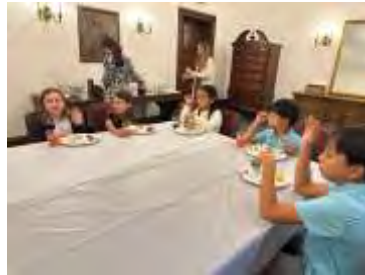
Communion Preparation Class