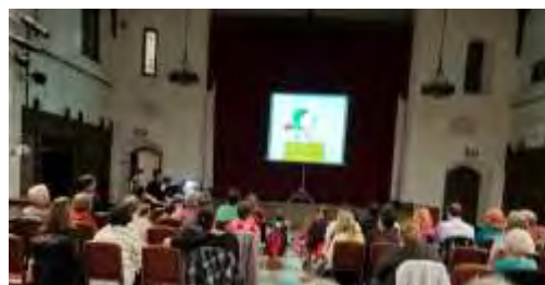
Charlie Brown Movie Concert