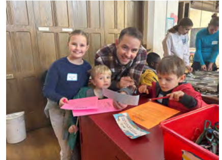
MLK Day of Service