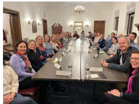
Board of Deacons Meeting