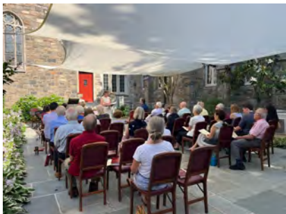
Worship in the Garden