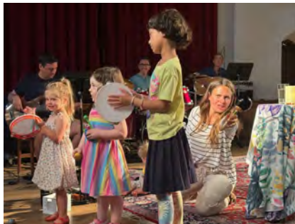
Children at WAVE joining in on the last song